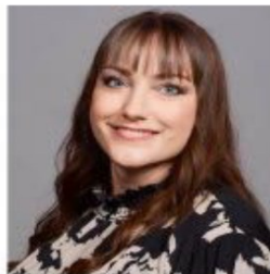
Hon. Brooke Graves County Treasurer Potter County