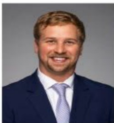
Hon. Kyle Hartmann Justice of the Peace Fayette County